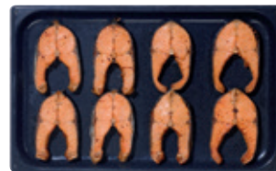
GN 1/1 crosswise insertion

Your benefits: a huge plus in capacity as well as increased productivity. Our flexibility concept speeds up all of the various processes in professional kitchens. And you not only save time, but valuable energy as well.*