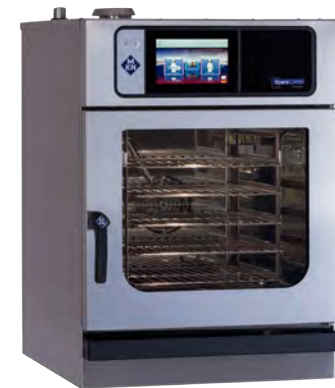
• SpaceCombi Junior MP capacity 6 x GN 2/3