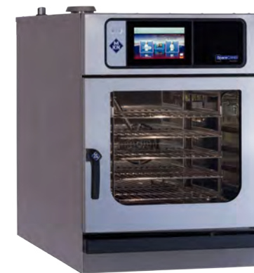
• SpaceCombi Compact MP capacity 6 x GN 1/1